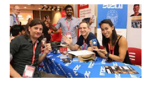
Exhibit Table Booth in Tech Pavillion

Feature your company in the exhibition hall, connect with businesses and partners, and take advantage of our attendee base for your sales or recruitment. This option includes one table with top signage, power socket, 3 exhibitor passes, and 2 social event passes.